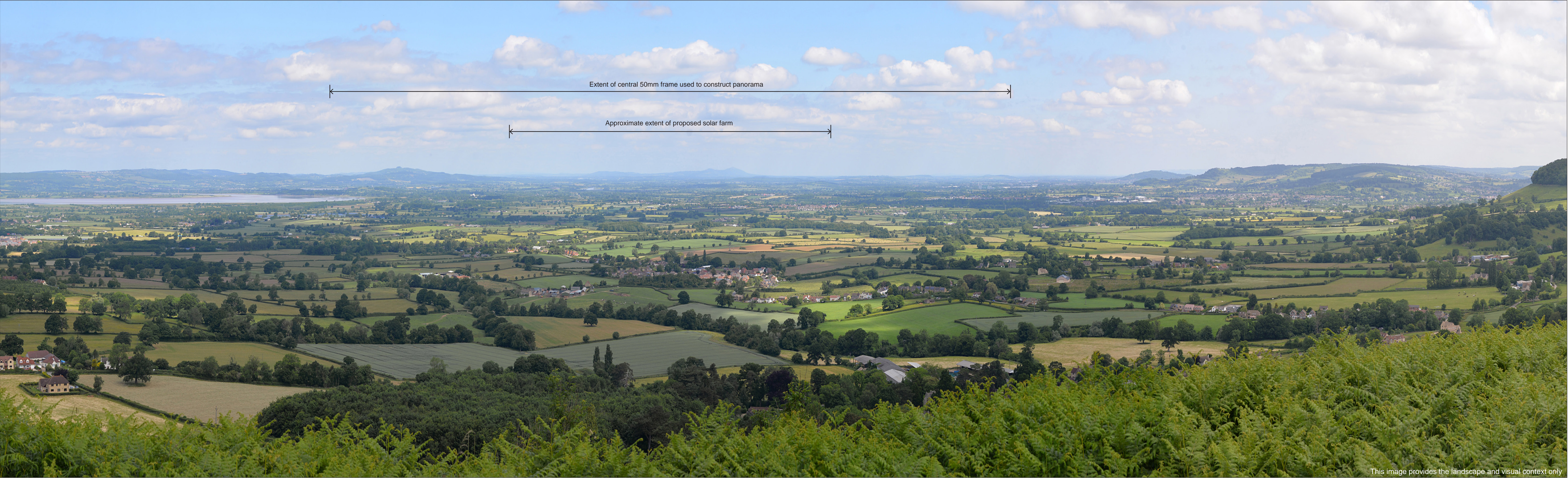
This image provides the landscape and visual context only