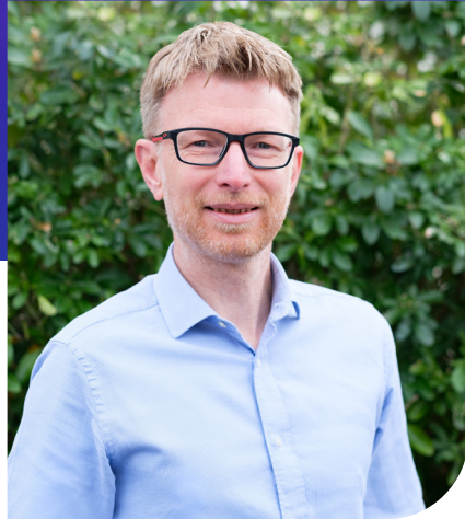
HEAD OF ENERGY SALES